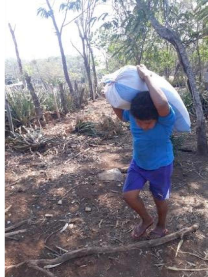
All hands were on deck helping with the bean harvest.