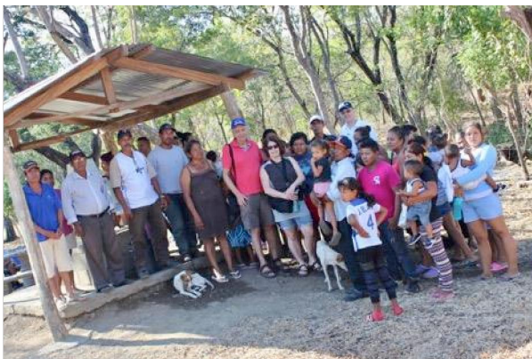
Meeting with families in Nandarola at new well site. So excited and enthusiastic!

The villages we support in Nicaragua depend on water from unsanitary wells or trucked in supply once or twice a week. Sanitation with limited or unsafe water is a challenge as you can imagine. Clean water is one of the basic rights of all human beings. We have drilled a few wells in communities in the past to help the situation, however we recognized this is totally inadequate. For the past 3 years we have been working on a Global Rotary Grant with the Rotary Clubs of Stratford and Granada Nicaragua that will bring wells, electric pumps and water towers to 6 villages and a distribution system to two of our larger villages where transport of the water is a hardship. This is combined with sanitation teaching and implementation to ensure that water is used wisely. This grant was recently approved and work will start shortly. The villages, local government and COMMIT are elated over this development. The impact not just for health and sanitation but also for the economy of those small villages is significant. Thank you to the Rotary Clubs involved, our donors and all the people that made it happen. Special thanks to Dr. Doug Thompson, Dr. Paul McArthur, and Rotarian Charlene Gordon for their incredible commitment and hard work to get this project approved.