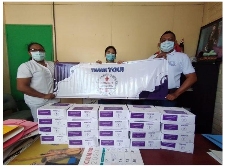
Surgical masks and tape purchased for the Nandaime Hospital.