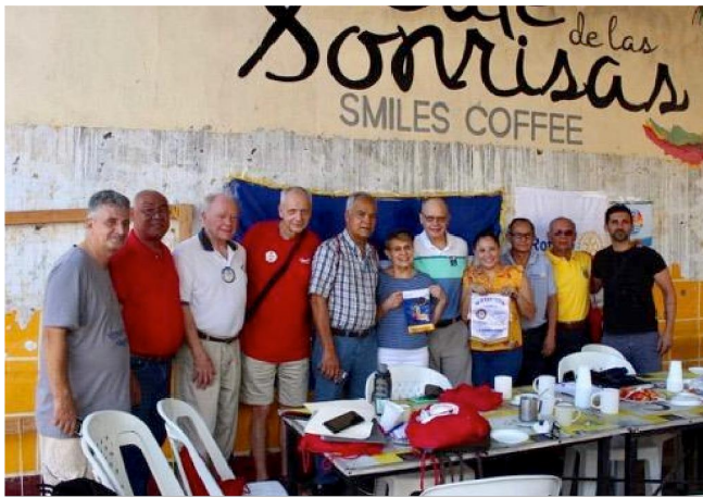
COMMIT team meeting with the Rotary Club of Granada, Nicaragua to discuss partnering opportunities.

Rotary is a worldwide network of inspired men and women who volunteer their time and talents to support their local communities around the world. COMMIT is grateful for the incredible support and commitment from many Rotary Clubs across Canada, the United States and Nicaragua.