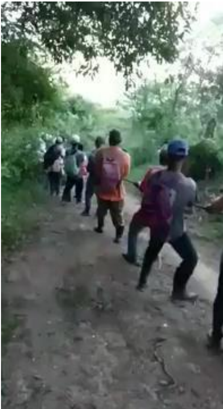
Transporting bean harvest.

Although pleased and encouraged by the success of our garden project in Nandarola, with the recent hurricanes approximately 90% of the crops were flooded and destroyed. Fortunately the bean field planted on rolling hills with better drainage yielded more than 6,300 pounds for 19 farmer members. Approximately 1,300 pounds of beans will be stored and planted next season. The leftover bean pods have been used in the composting fields. Harvesting and transporting the beans down the steep hills was a real challenge because of the hurricane flooding, however Nicaraguans are resourceful. Click here to experience Nicaraguan ingenuity and hard work. Overall the bean project generated a profit of $173.00 that will be invested in future crops and projects. Future plans may include a chicken farm, producing eggs to feed local communities and possible sales to grocery stores and markets. Discussions are currently under way to expand the garden project with 10 new members and starting a new project in the village of La Vigia.