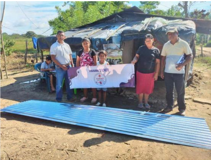
Roofing supplies funded by COMMIT.

Not only has Nicaragua been suffering the effects of the COVID pandemic, they were also hit hard by two back-to-back hurricanes in 2020. COMMIT has donated more than $20,000 to purchase food, roofing materials, surgical masks and other pandemic supplies for several small villages devastated by these disasters. Special thanks to Edgar Avilla and his family in Nicaragua for helping to purchase, package and distribute these desperately needed supplies.