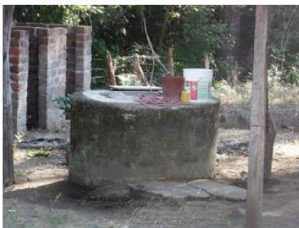
Hand-dug wells in many villages are easily contaminated and often dry.