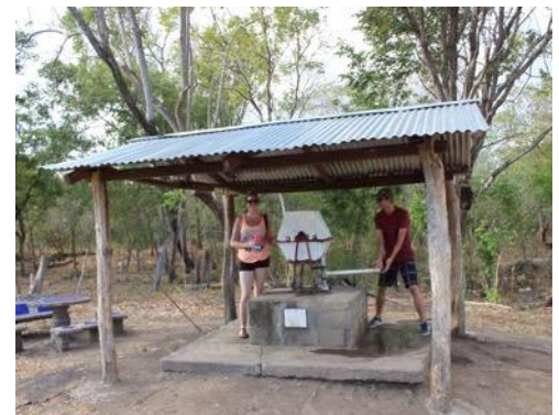
One of our first wells drilled in Nandarola, which will be replaced.