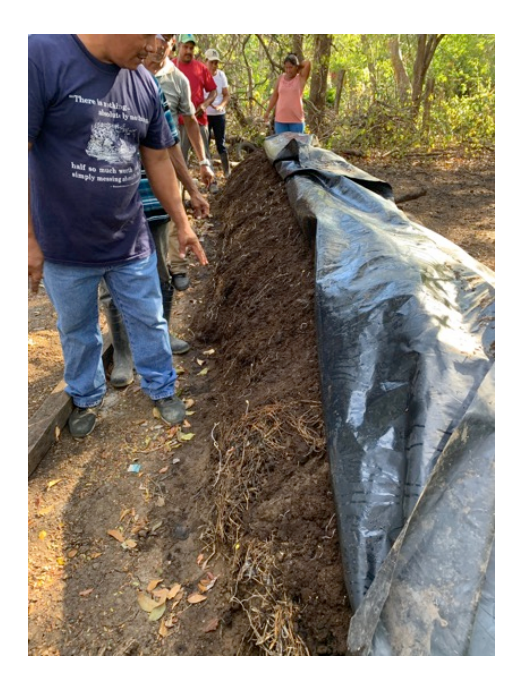
Composting in Nandarola

A few months ago our farmers started a bean project. Every grower grew approximately an area of 1.7 acres or its equivalent to one manzana in Nicaragua standard measurements. The crops are flourishing and growing well. This will provide the people with enough beans for their families, enough to pay for the rental of the land, and enough to save for planting the next bean crop. The farmers of Nandarola are truly becoming more and more self-sufficient.