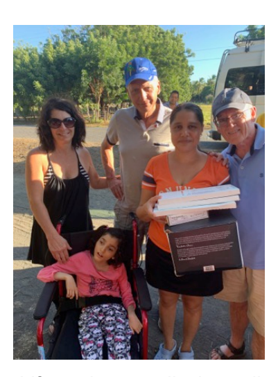
Life savings medical supplies, a wheelchair and blender delivered to a 11-year-old girl shown here with her Mother