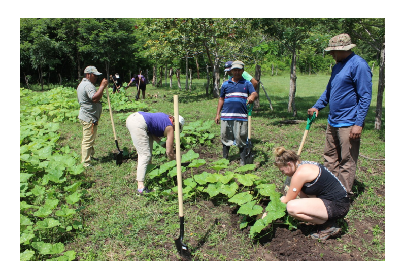
COMMIT volunteers working along side local farmers in the gardens