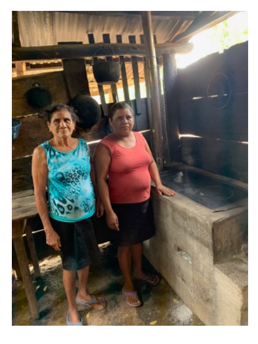
New stoves are properly vented and easy to use

Imagine cooking on a cement block with an open flame inside your own home. Imagine the smoke and potential danger, especially to your children. This is what happens virtually in all the remote villages where we work. A pilot project with 6 villagers in Nandarola using eco friendly stoves has been so successful are goal now is to provide new stoves for all 110 families in this village. For this project, our funding raising goal is $50,000 US.