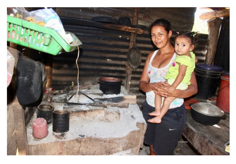
Old wood burning stove shown above has no ventilation and is a serious health hazard for families especially children

Innovated design of this stove manufactured by a supplier in Nicaragua uses approximately 30 % less wood and better for the environment.