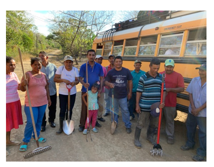
COMMIT delivers supplies, equipment and funds for the farmers in Nandarola