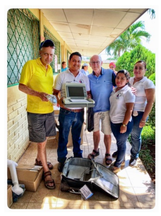
ECG machine donated to the hospital