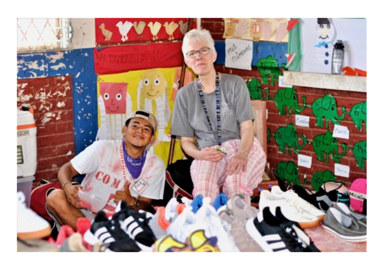
Adidas provided 2,500 pairs of shoes, soccer balls and clothing. Bev & translator fitted diabetic patients with new shoes