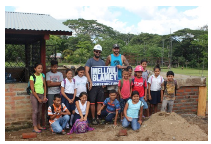
COMMIT Team worked along side the villagers to complete the Community Centre addition