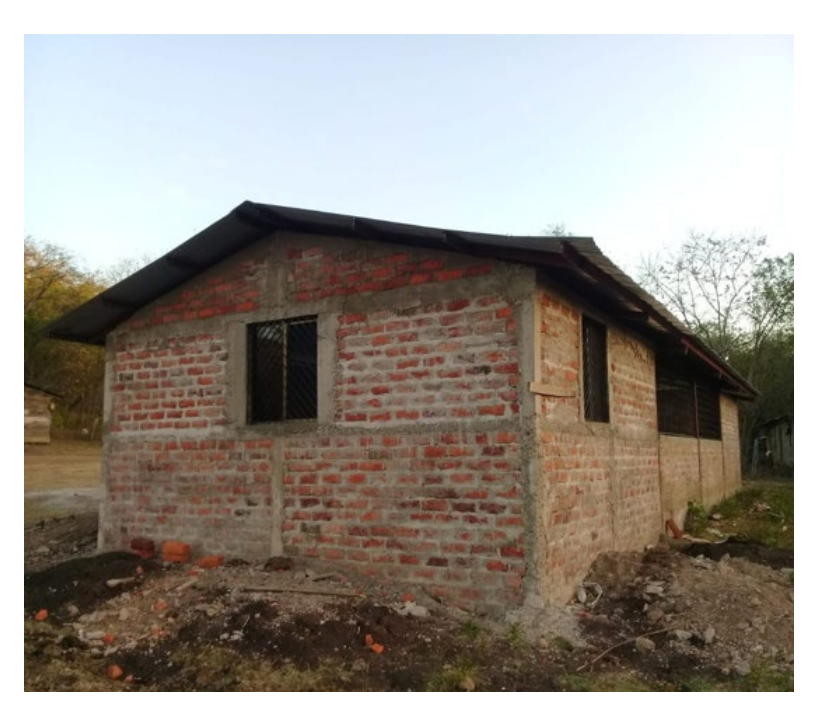
Completed Community Centre in Nandarola